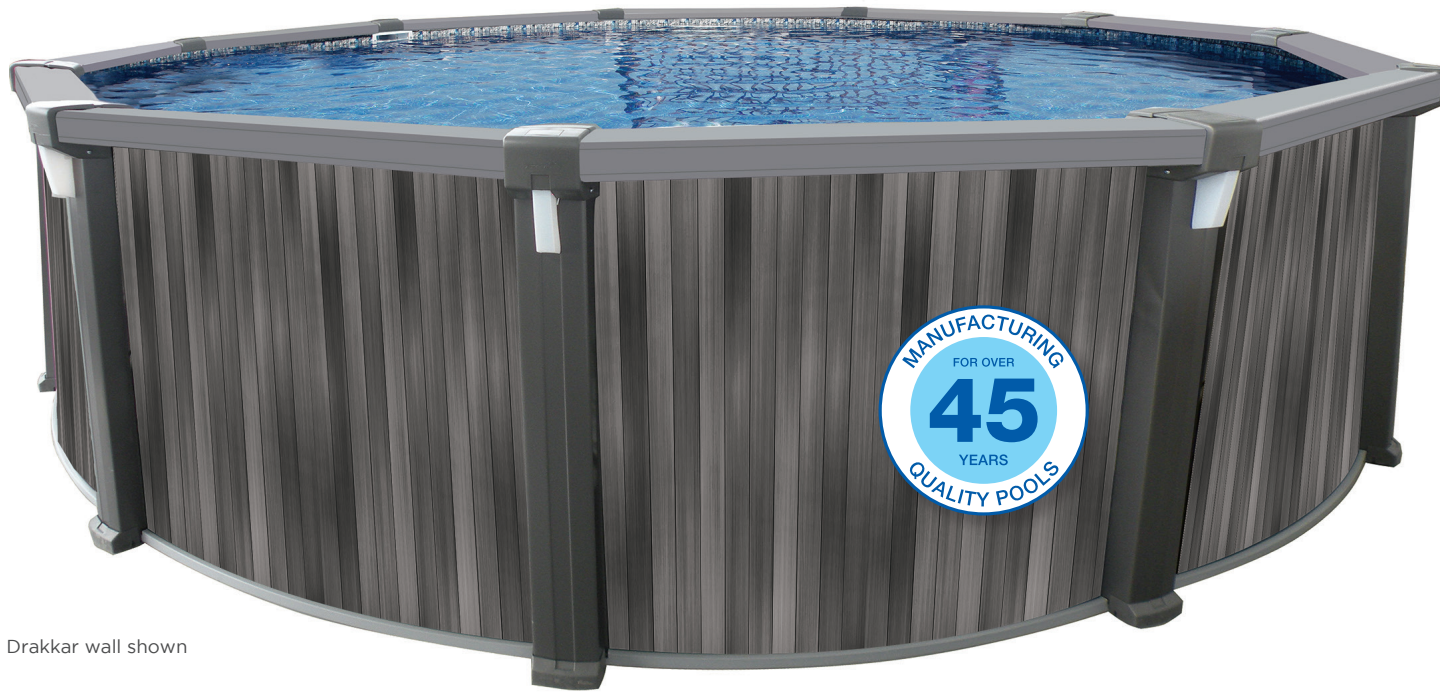
Drakkar wall shown