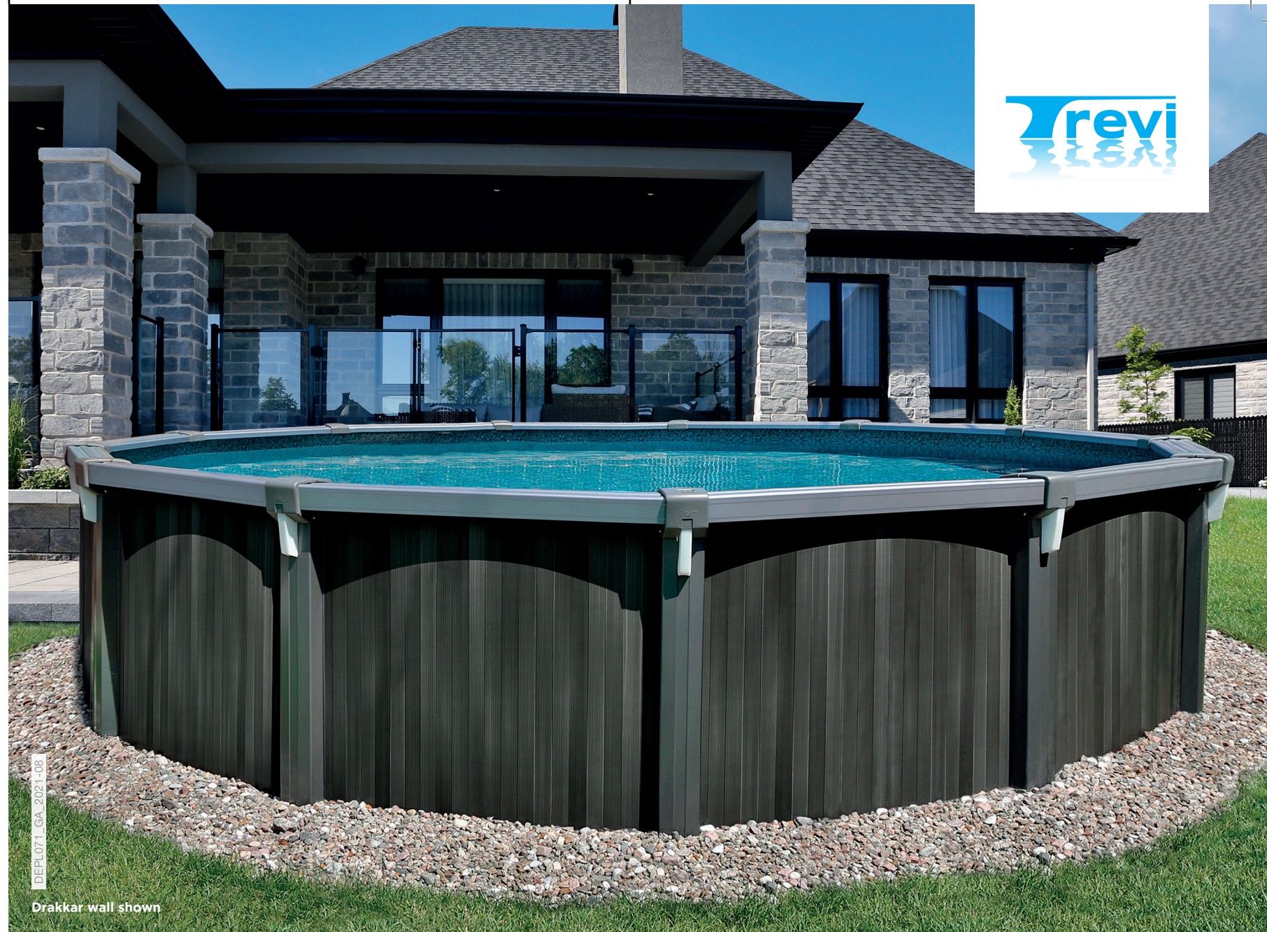
Drakkar wall shown