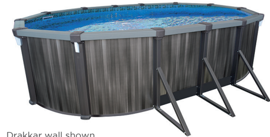
Drakkar wall shown